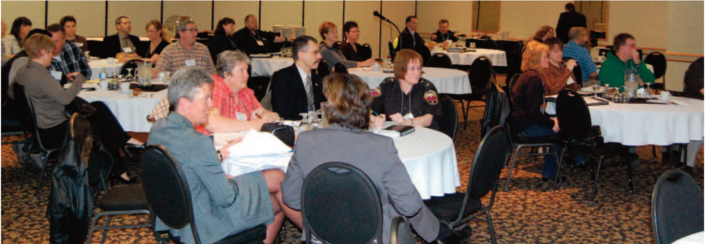
Members listen to presentations at SCoP's 2011 AGM