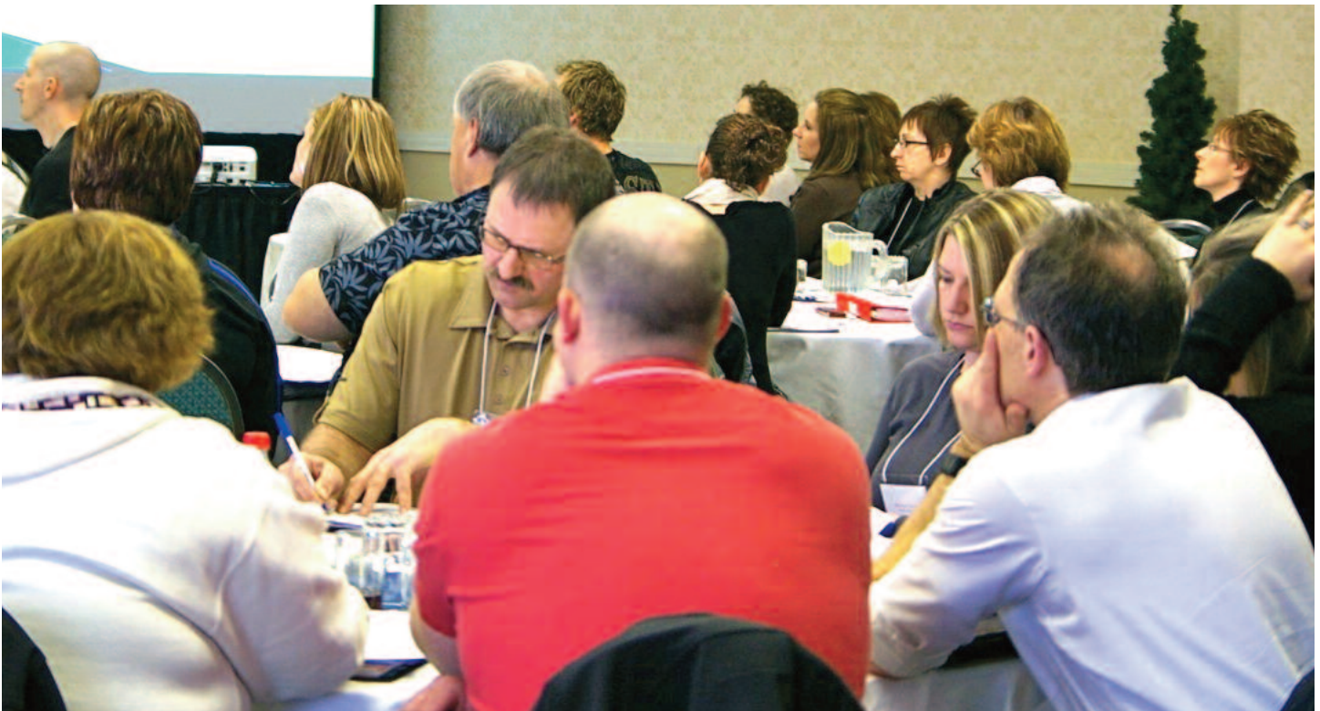
Coordinator training session held in Saskatoon, January 2010

The next “new applicant” coordinator training session runs on March 5, at the SCoP offices in Regina. SCoP will also offer a “refresher” training session for existing coordinators in the fall. To register for a coordinator training session, please contact SCoP.